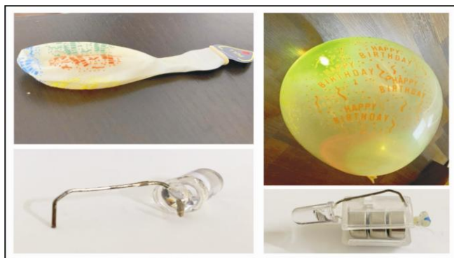
Fig. 3: LED balloon uses an encased battery attached with an LED bulb via hook.