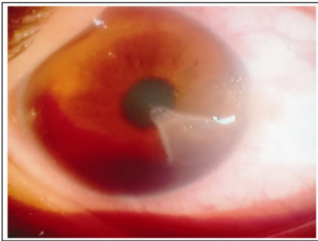
Fig. 3: Lamellar corneal laceration with hypHEMA.

haemorrhage was present in 103 (26.2%) Cases, retinal tear was present in 13 (3.3%) cases, retinal detachment was present in 29 (7.4%) cases, commotio retina was present in 22 (5.6%) cases. Optic nerve swelling was noted in 32 (8.1%) cases. Distribution of cases according to place of injury is given in table 3. Presenting visual acuity was 6/12 or better in 139 (35.4%) cases, between 6/12 and 6/60 in 98 (24.9%) cases and less than 6/60 in 156 (39.7%). Distribution of cases according to time to presentation in hospital is shown in table 4. Prolapse of intraocular contents was noted in 122 (31.0%) cases.