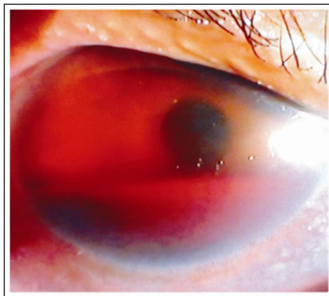
Fig. 1: Hyphema as a result of blunt ocular trauma.