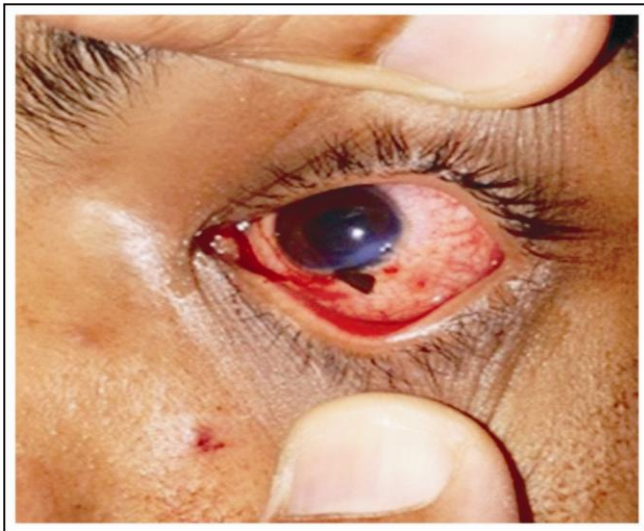
Fig. 4: Limbal perforation, Iris and vitreous prolapsed following ocular trauma with Key.