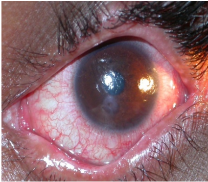
Fig 8. Severe dry eyes post SJ syndrome