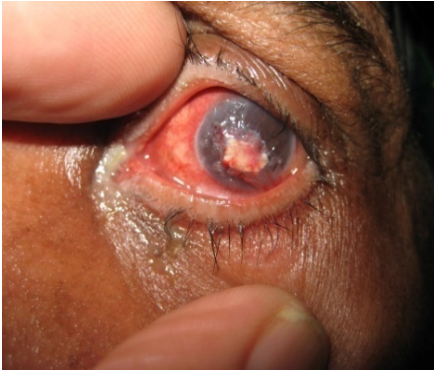
Fig 6. Conjunctival flap + scleral graft