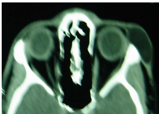
Fig. 3: CT scan depicting the same cyst