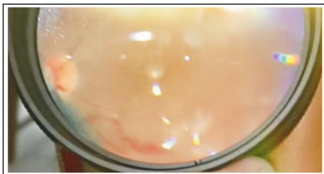
Fig. 4: In a silicone oil filled eye there is neo vascularization at disc and neo vascularization elsewhere.