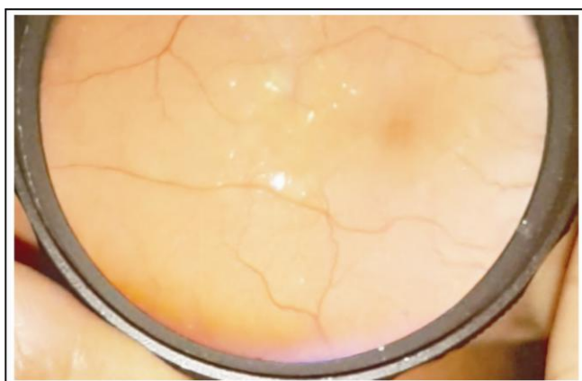
Fig. 1: Retinal thickening, hard exudates and clinically significant macular oedema