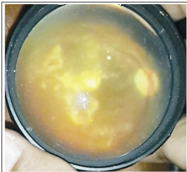
Fig. 5: Massive plaque exudative maculopathy.