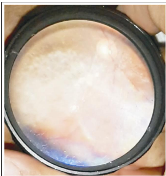
Fig. 6: Asteroids hyalosis.